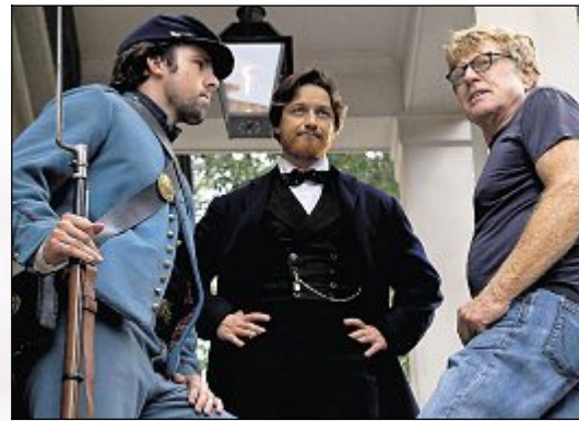
On the set: Director Robert Redford, right, talks with James McAvoy, center, and an unidentified extra.